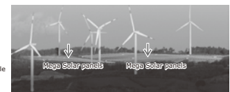
Fig. 1 Renewable energy in southern Italy.

Mega-solar panels that take advantage of southern Italy's high percentage of sunshine