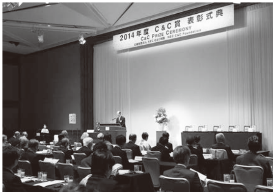
Photo 1 2014 C&C Prize Ceremony.