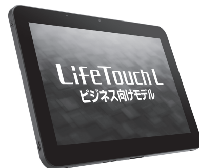
Photo 1 LifeTouch L.

The LifeTouch L business model ( Photo 1 ) is a smart