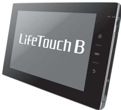
Photo 3 LifeTouch B.

The LifeTouch B series of tablets (LifeTouch B ( Photo 3 ) and LifeTouch B Plus ( Photo 4 )) are smart devices with a 7-inch LCD, which support business use in stores, offices and sales activities both in/out of the office thanks to clear