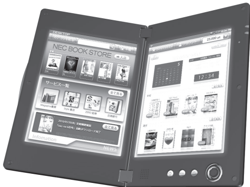
Photo 5 LifeTouch W.

The LifeTouch W features a unique book-style shape and dual screen.