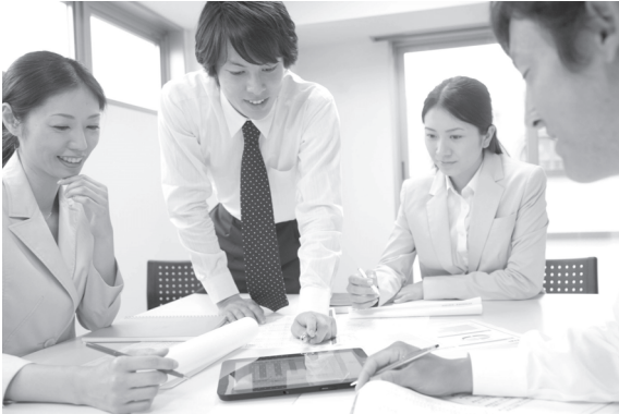
Photo 2 Example of style of usage at meetings.

device intended for supporting business applications that require an easily visible, attractive and large screen for displaying information. The large 10.1-inch screen makes it suitable for mobile work involving the presentation of materials, browsing emails in a meeting or out of the office, sales work involving face-to-face presentations and customer service or for the display of signage.