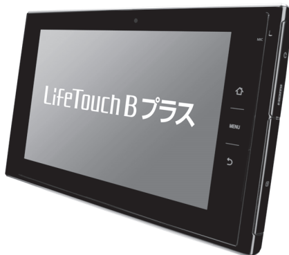
Photo 4 LifeTouch B Plus.