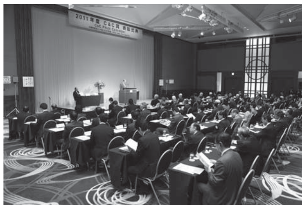
Photo 1 2011 C&C Prize Ceremony

In the acceptance speech of Prof. Norman Abramson, he introduced the history of developing “ALOHANET” access control system, that connected computer facilities on the Hawaiian Islands by a wireless network, and how the system was improved and applied to Ethernet, mobile data communication, and Internet access in general. In addition, Dr. Robert M. Metcalfe thanked cooperating companies and persons for their partnership to implement and deployment of Ethernet. He also appreciated Japanese supports from the early stage of developments. Many attendees may be impressed to hear that there had been many contributions by Japanese in such a leading-edge research.