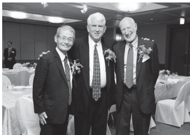
Photo 3 Dr. Akira Yoshino, Dr. Robert M. Metcalfe and Prof. Norman Abramson (From left to right).