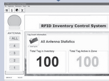
After collecting all of the life jackets