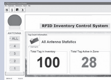
During use of life jackets

When the number equal to the total number of life jackets is read out, the system assumes that all of the users have returned to the shore safely and the lamp at the top left is switched from red to green.