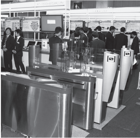
Photo 1 The flapper gate image captured in the iEXPO hall.

system. The traditional entrance/exit management systems performs authentication based on the individual ID data that has been registered in the IC card, etc. in advance, and record the entrance/exit information in a log. The log presupposes that the person who makes entrance or exit based on authentication is the owner of the IC card, etc. but in reality it cannot confirm that it is actually that person using the card. If a person uses a lost card or two persons attempt to make an entrance by “piggybacking,” the log cannot record the data correctly.