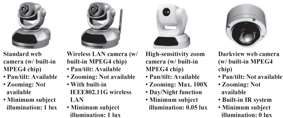
Fig. 2 Camera Lineup.