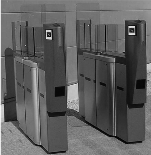
Photo 2 Image of hyper-door type gate.

unit that has flappers on both sides. These two types can be combined to assure the required number of passages.