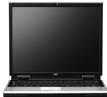
Photo 2 VersaPro Thin Client (Virtual PC Type/Screen Transfer Type).