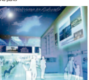
People friendly (1)