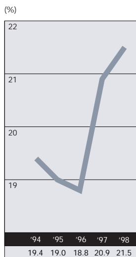
SHAREHOLDERS' EQUITY RATIO