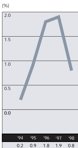
RETURN ON SALES