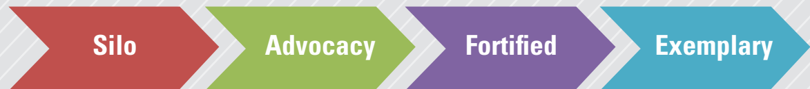
Figure 1. S.A.F.E. Framework

Using the S.A.F.E. Framework, we can assess the current status of a city's public safety in four phases: Silo, Advocacy, Fortified and Exemplary (Figure 1).