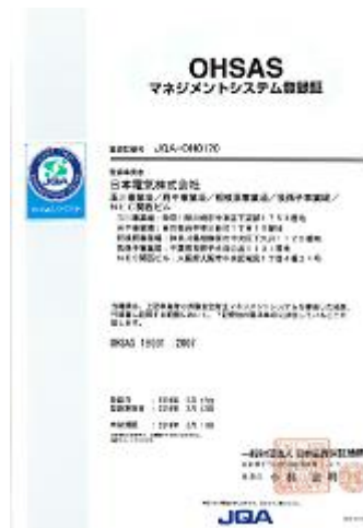
OHSAS18001 Specification Certificate