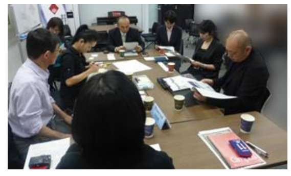
Meeting with many stakeholders