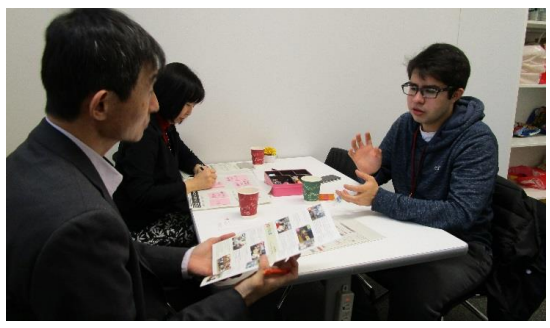
Interviewing a foreign student