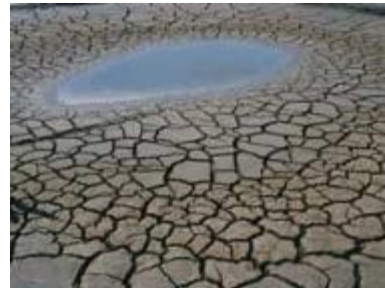
6. Loss of livelihood and income in rural areas due to insufficient water resources and reduced agricultural productivity