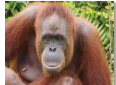
8. Loss of services provided by terrestrial and inland water ecosystems