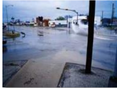
2. Damage caused by flooding in urban areas