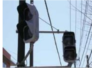
3. Breakdown of infrastructure and other societal functions due to extreme weather events