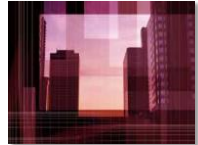
4. Death and ill health caused by heat waves which particularly affect vulnerable groups in urban areas