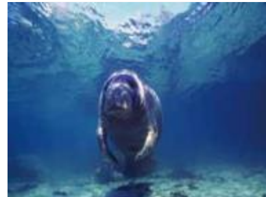
7. Loss of marine ecosystems that are vital to coastal water areas