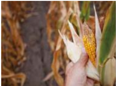
5. Threat to food security caused by rising temperatures and drought