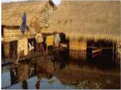
1. Damage caused by rising sea levels and storm surge in coastal areas