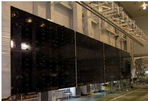
ETS-VIII (2006) Two Wings /Rigid Wing 3.23m x 2.46m

Since 1971, more than 70 Rigid and Flexible Solar Arrays have been supplied including overseas commercial satellites.