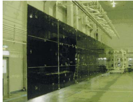
ALOS (2006) One Wing/Rigid Wing 2.3m x 3.04m