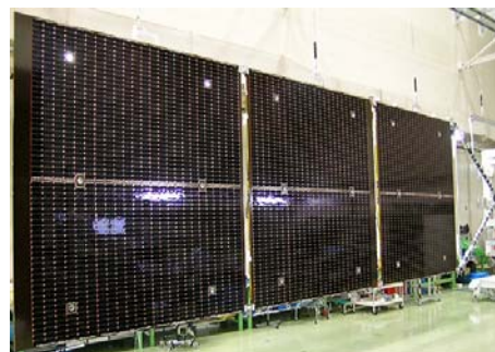
WINDS (2007) Two Wings/Rigid Wing 2.0m x 2.34m