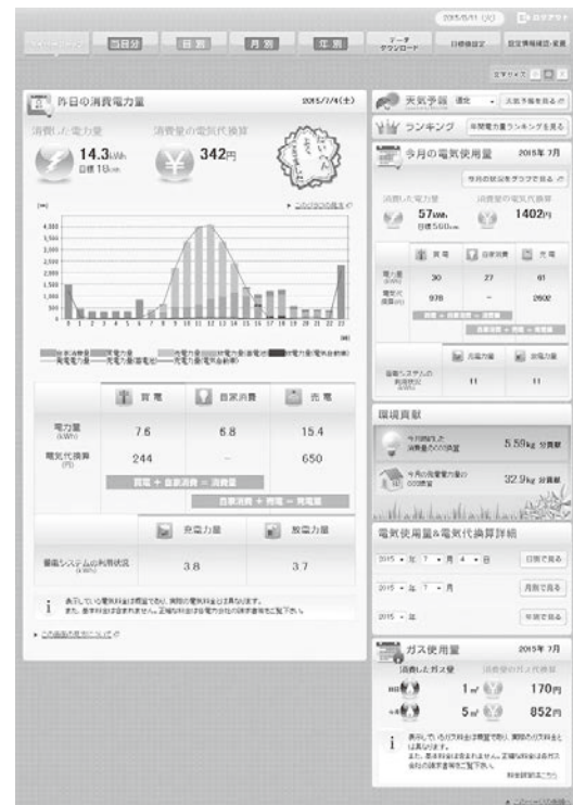
Fig. 1 Image of a top display.

HEMS is connected to various devices including: the ECHONET Lite-compatible Smart Meters, Smart Distribution panel, home stationary storage battery system and the Vehicle-to-Home-compatible