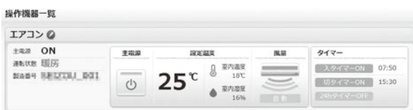
Fig. 3 Web remote control (Controllable from a browser).

In addition, HEMS supports the user's energy-saving operations by optimally using cloud computing. It predicts the PV generation amount for the next day based on the weather forecast information.