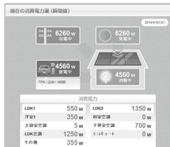
Fig. 2 Momentary power consumption value of an EV-connected system.

EV charger/discharger. Multi-vendor equipment is thereby enabled to be integrated and visualized (Fig. 2). HEMS system may then be used as an effective household multi-monitor.