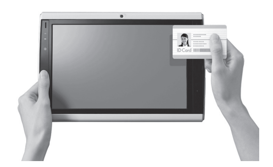
Photo 1 Size reduction of the NFC module enabling IC card authentication on a tablet front panel.