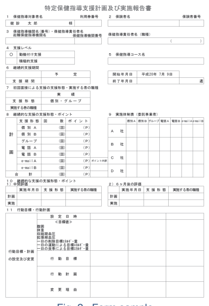
Fig. 2 Form sample.