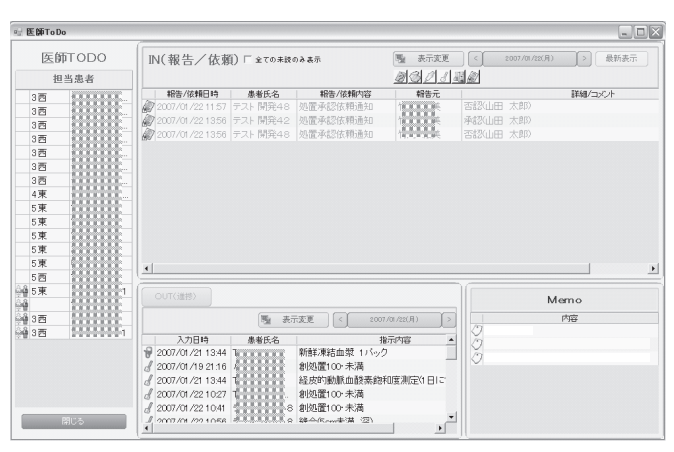
Fig. 3 Example of Doctor ToDo.

Fig. 2 Illustrations on the main display.