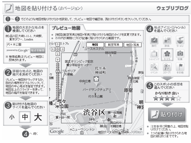
Fig. 3 WebryMap.

In future, by applying this service to a mobile phone with a GPS function, a solution can be realized that a user may post