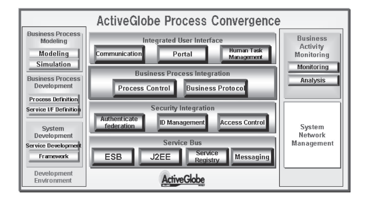
Fig. 1 Outline of ActiveGlobe Process Convergence.

The ActiveGlobe SECUREMASTER ensures secure service access with a single sign-on operation.