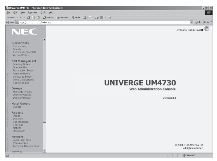
Fig. 2 Web browser interface of the UM4730.