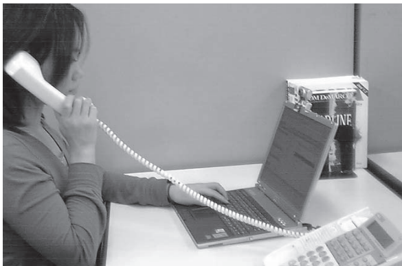
Photo 1 Image sample of office work.