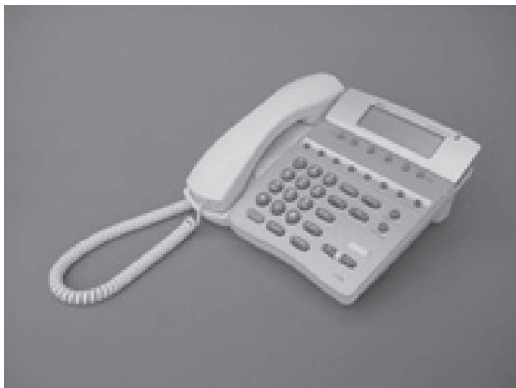
Photo 2 External view of Dterm IP phone.