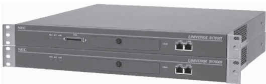
Photo 4 External view of SV7000.