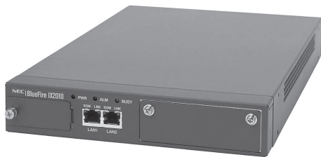
Photo 5 External view of IX series.