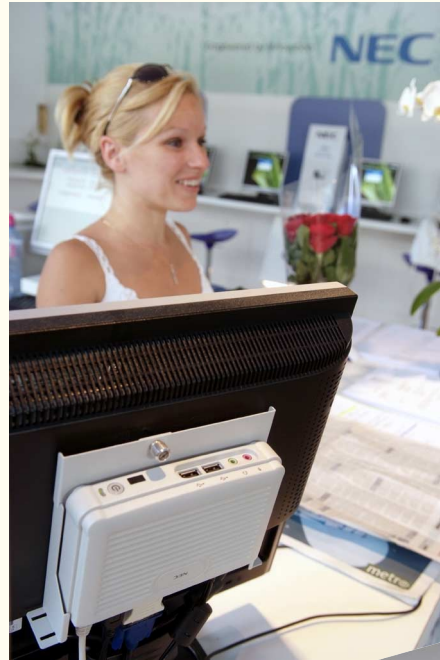
US100 (Virtual PC thin client terminal)

In these ways, NEC has steadily strengthened the Festival's global capabilities by providing accessible, reliable IT solutions as well as superior customer satisfaction and service.