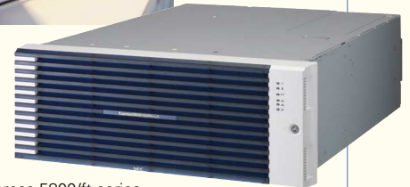
NEC Express 5800/ft series