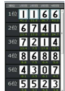
All candidates list