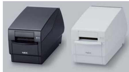
58mm 240mm/s Thermal Receipt Printer