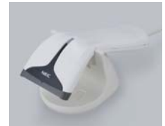
Barcode Handheld Scanner

*Microsoft Windows and Windows logo are trademarks or registered trademarks of Microsoft Corporation in the United States and other countries.