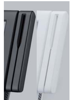
ISO1/2/3 Magnetic Strip Reader