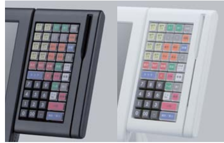
47 key Vertical Keyboard