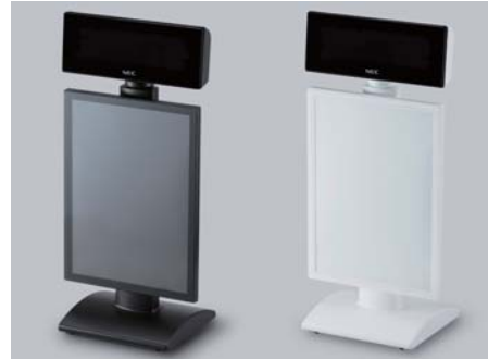
Customer Display with POP panel