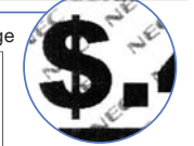
·Background Printing-Enlarged Image