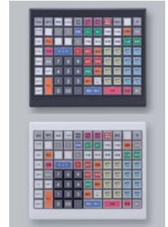
84 Key POS Keyboard