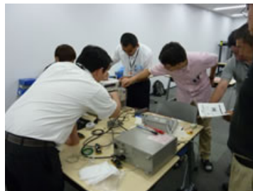
Measuring voltage at Safety Review Workshop