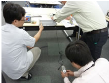
Testing the strength of a locked power cable at Safety Review Workshop

NEC is also training more safety technology specialists by holding "Safety Review Workshops" where safety technology is taught using actual equipment.