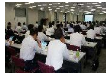
Seminar on conflict minerals

In fiscal 2018, NEC joined the "Education and PR Team" and the "Smelter Support Team" under the Working Group. As part of the Education and PR Team, NEC acted as a presenter in a joint briefing for its suppliers and worked to understand their particular conflict-mineral problems. For the Smelter Support Team, NEC directly encouraged overseas smelters that had not yet been certified as "Conflict Free" to get audited and certified.