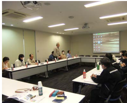
Meeting at Abiko plant

Continuing from last year in collaboration with Abiko citizens, NEC provided an opportunity for 13 people from the city to participate in observing copera tokyoensis dragonfly on July 8, 2017.