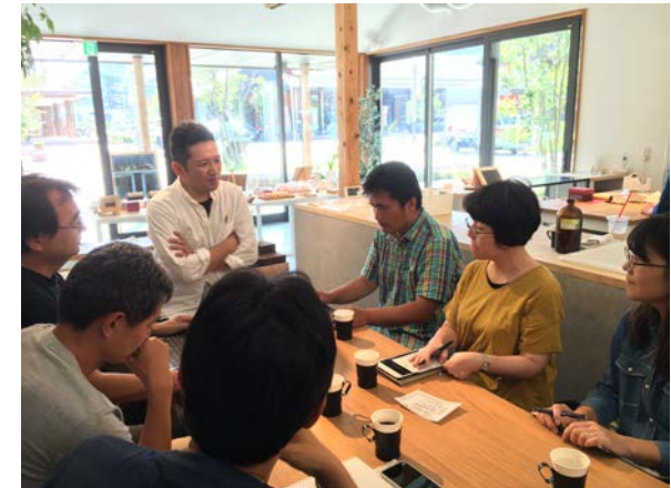
Meeting in Onagawa town