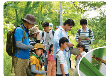
Copera tokyoensis dragonfly

In collaboration with Teganuma Aquatic Life Conservation Workshop, Abiko City