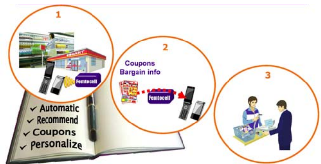
Figure.3 Change Your Shopping Style

Mobile Phones will be service portals when in store and change the retailer-customer relationship.