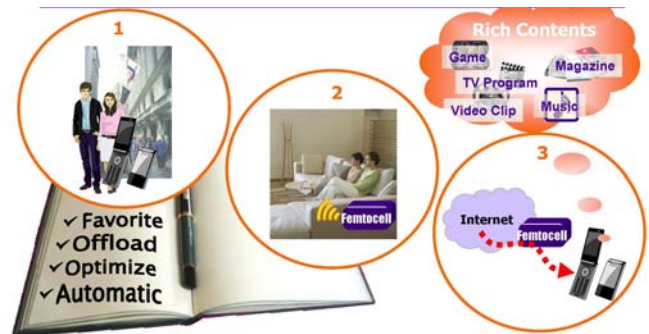
Figure.2 Change Your Lifestyle

Your favorite contents will be delivered to you comfortably.