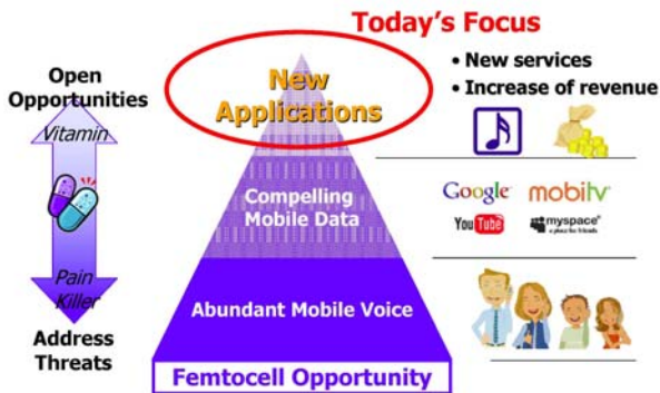
Figure.1 Operator's View of Femtocell

Operators will see Femtocell as a key driver for introducing application based on several attributes of the end user that are available to the operator.